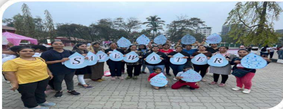
Students participated in Walkathon & given message on SAVE WATER