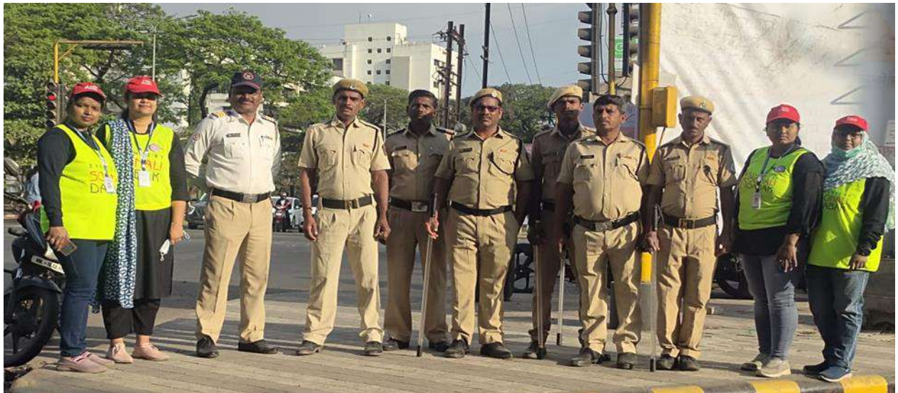
NSS Volunteers with Traffic police