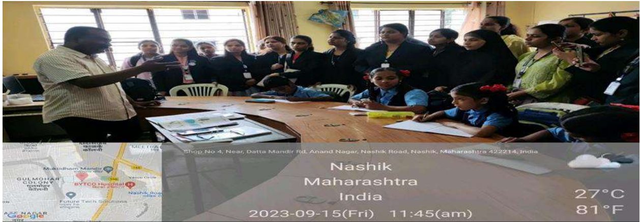
Teacher explaining methods of teaching to hearing impaired students