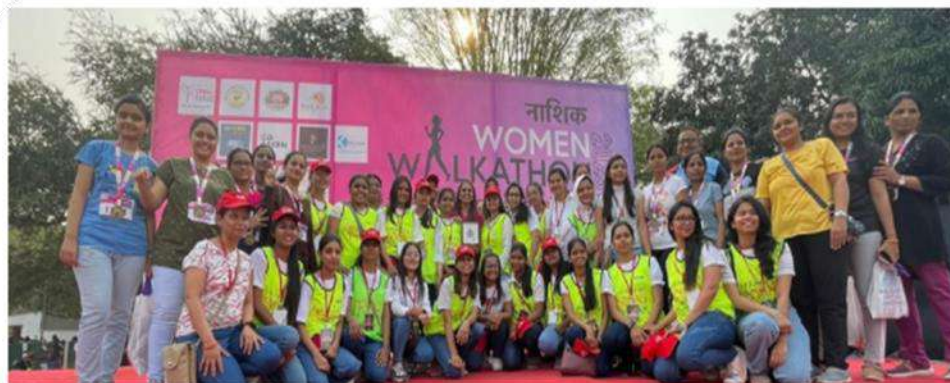
Volunteers worked as traffic police during walkathon