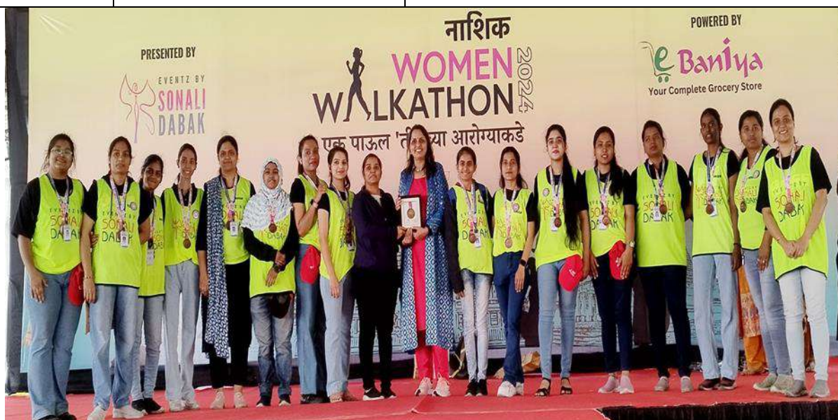
Felicitation of Volunteers by College