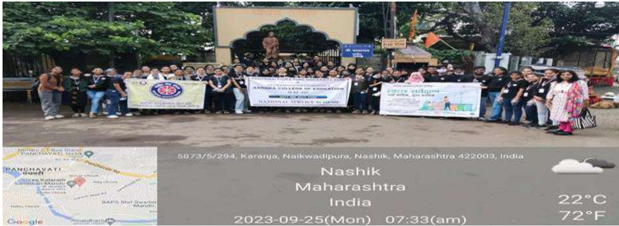
NSS Volunteers ready for cleanliness