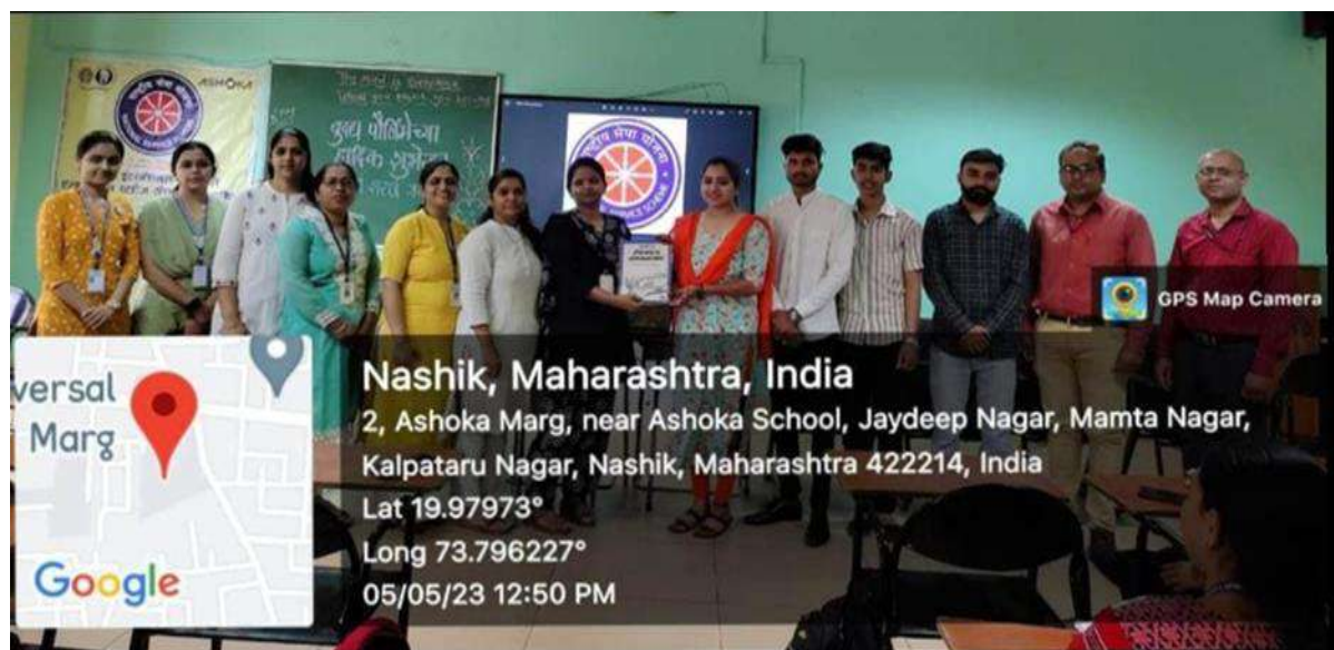
Books handover to Samatva Foundation

Introduction (of Activity) : Books play important role in every student's life, its provide information, imagination, entertainment etc. AICESR in collaboration with Samatva Foundation donated 155 books to a library of ZP School, Beze, Trambakeshwar, tribal area. We believe together, we can bridge the gap and open new chapters of learning for the underprivileged students through this books donation drive.